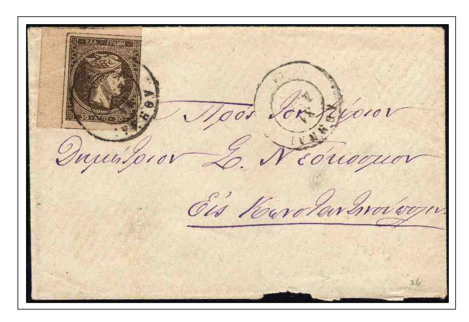
EL from Athens [A \Theta HNAI (1) 31 MAPT. 81] to Constantinopolis [K \Omega N \Sigma TANTIN (TOYPKIA) 2 A \Pi P. 81]