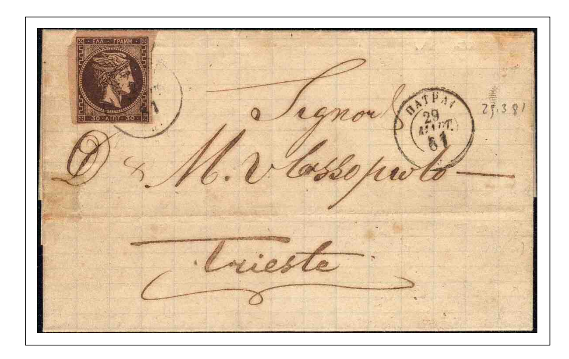
EL from Patras [ПАТРАІ (9) 29 MAPT. 81] to Trieste [TRIESTE 14 4 81]