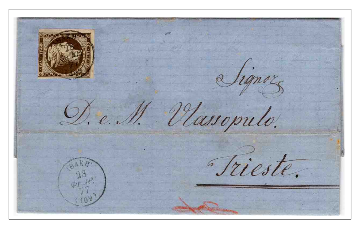
EL from Ithaca [IOAKH (109) 28 ΦEBP 77], via Corfu [KEPKYPA (106) 4 MAPT 77] to Trieste [TRIESTE 19 3 77]