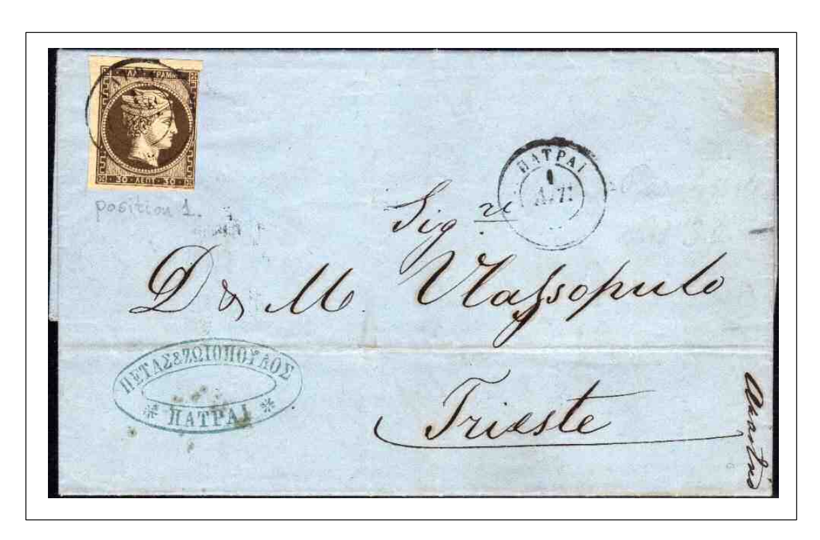
EL from Patras [ΠΑΤΡΑΙ (9) 1 ΑΥΓ 76], via Corfu [KEPKYPA (106) 2 ΑΥΓ 76] to Trieste [TRIESTE 16 8 76]