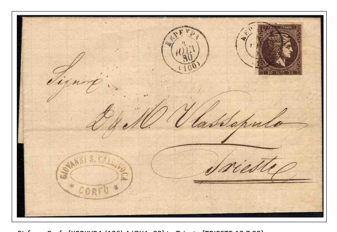
EL from Corfu [KEPKYPA (106) 4 IOYA. 80] to Trieste [TRIESTE 18 7 80]