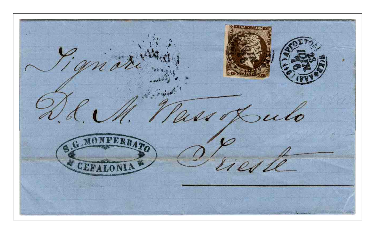
E.L. from Argostolion [AP \Gamma O \Sigma TO \Lambda ION (KE \Phi A \Lambda \Lambda.) (110) 23 IOYN 76], via Corfu [KEPKYPA (106) 24 IOYN 76] to Trieste [TRIESTE 9 7 76]