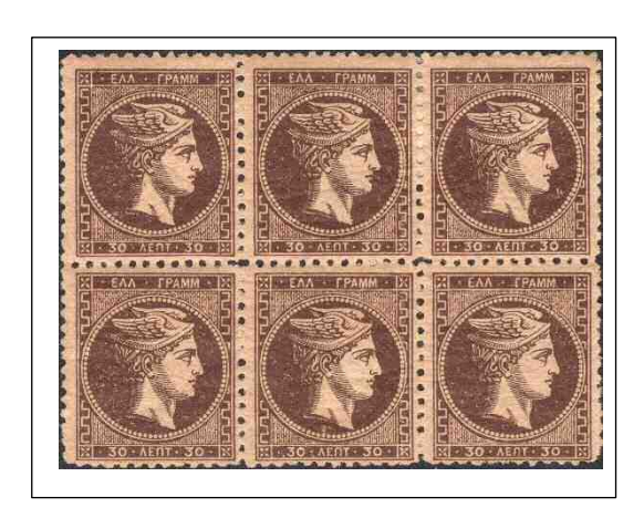
Perforation 11 ¾